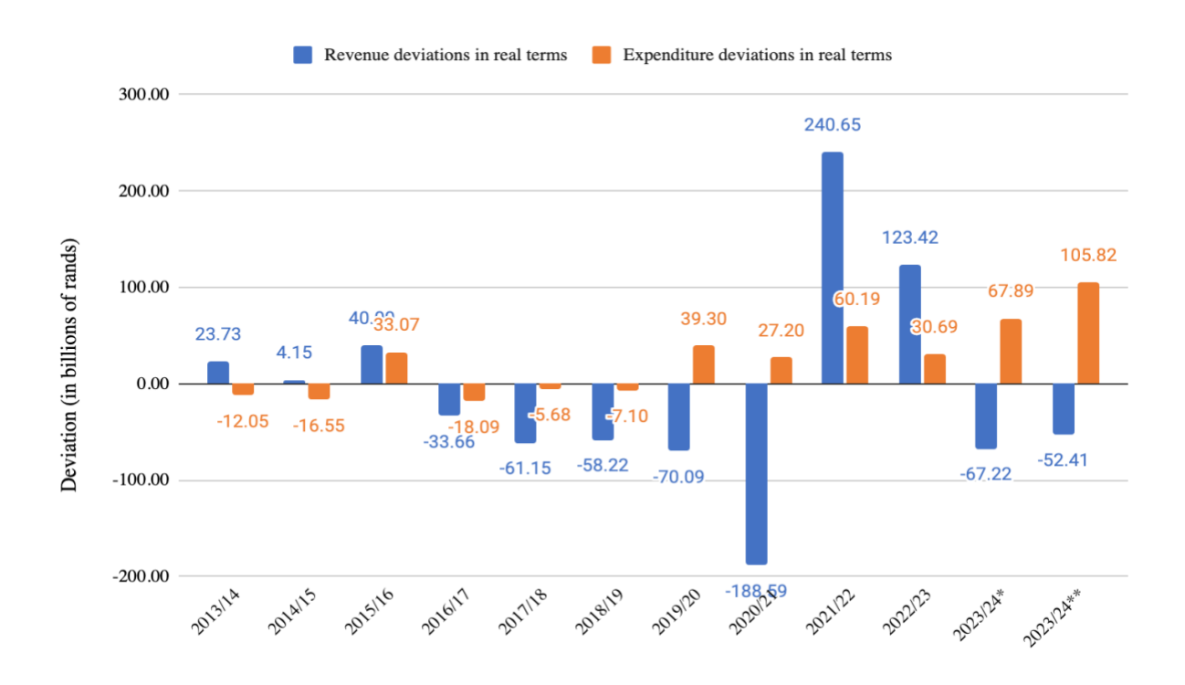
Figure 1: Revenue and expenditure deviations in real terms (April 2023 rands) with projections for 2023/24 made before the MTBPS (2013/14 – 2023/24)<sup>2</sup>

The R44 billion revenue shortfall is in line with historical norms. Figure 1 shows that in the immediate pre-Covid-19 period, 2016/17 to 2018/19, the government experienced revenue shortfalls (in real terms) in the range of R33 to R70 billion.